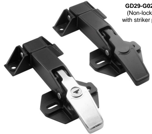
GD29-G02096 (Non-locking, with striker plate)